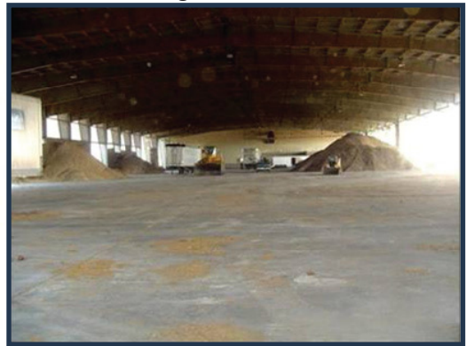
Building #2 - 83,000 SF