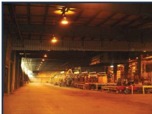
Building #1 - 100' x 550' Bay