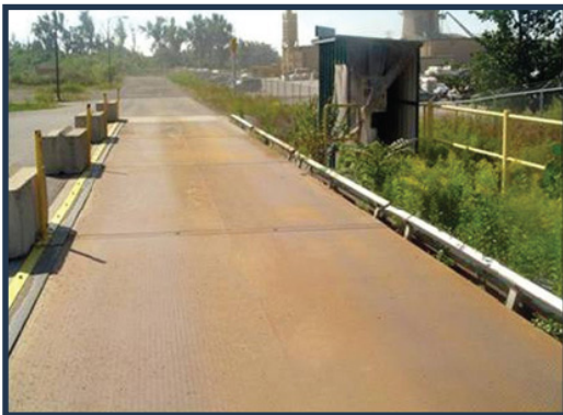
Truck Weigh Station