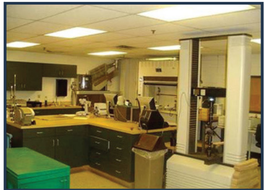
Second Floor - Supervisor Offices