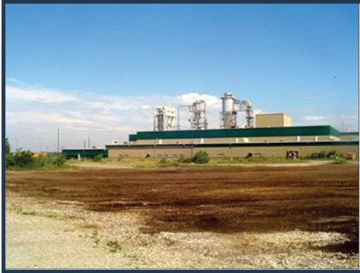
Building #1 - 170,000 SF